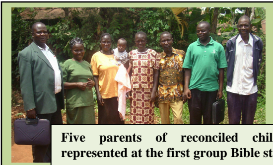
Five parents of reconciled children represented at the first group Bible study!

When Peter wrote his second letter to the churches, persecution and falsehood had invaded the church. This pastoral letter from Peter is written to encourage God’s people to stand strong in the face of this invasion of falsehood. Peter could have written this letter to the church in Kenya. Many churches in Kenya have an outward appearance of Christianity but once you are inside you discover that superstition, corruption, greed and a religion of fear dominate. These weaknesses have particularly invaded the areas of Western Kenya where we happen to be restoring children with their families.