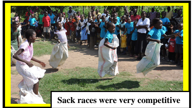
Sack races were very competitive

But the fun was just starting as the afternoon was filled with games and fun for all the children. Sack races, balloon blowing contests, and egg races highlighted an afternoon of joy without measure for all the children, including many from the community who attended the prayer event for the first time in their lives.