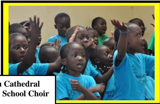
Kisumu Cathedral Sunday School Choir

In this story we see just how precious prayer is to the Lord of heaven and earth. He loves and longs to hear from his children. He especially loves to hear from his young children.